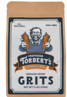
Orange Corn Grits