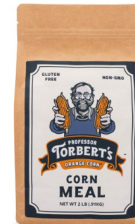
Orange Corn Meal